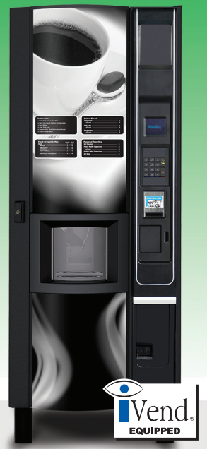
VendRevv Coffee Vending Machine Hot Beverage Merchandiser 72" x 28"W x 28"D, *Ship Weight 361 lbs 11 Major selections and up to 34 different combinations, 487-7oz Cups or 384-12oz Cups