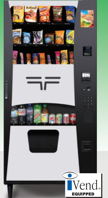
TKO 2 Combo For under 50 customers Snack & Beverage 74.5" x 34.5"W x 31.25"D, *Ship Weight 621 lbs 29 Selections Capacity: 217 Snack / 139 Beverage