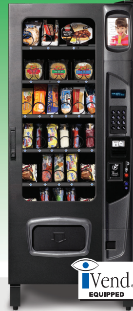
MPZ Frozen Black Diamond Series Frozen Food 72" x 29.5"W x 38"D, *Ship Weight 680 lbs Selections: 28 Frozen Capacity: 320 Items Vends frozen foods & desserts. ** Available in dual-zone (Frozen/Refrigerated Configuration)