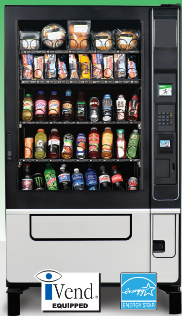
VendRevv 42 Select Chill Center Glass Front Can, Bottle & Food 72" x 41.2"W x 38"D, *Ship Weight 811 lbs 42 Selections Capacity: 280 items (118 Food & 162 Drinks) Card reader available