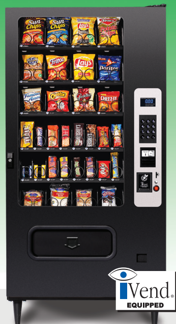
32 Select Snack Merchandiser 72" x 35.2"W x 34.75"D *Ship Weight 481 lbs 32 selections, 474 item capacity Card reader available.