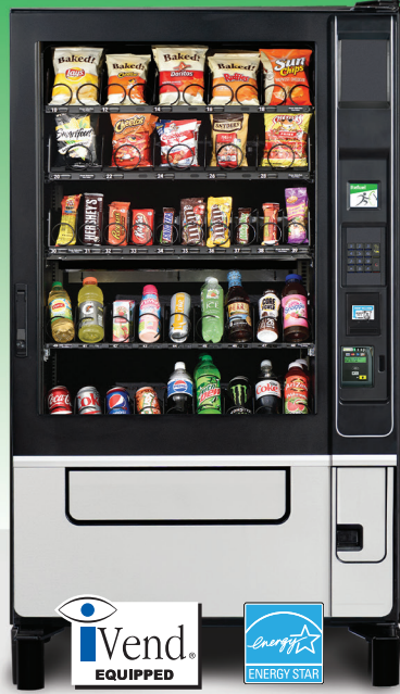
VendRevv 38 Select Chill Center Glass Front Can, Bottle & Snack 72" x 41.2"W x 38"D, *Ship Weight 811 lbs 38 Selections Capacity: 376 Items (100 snacks, 168 Candy & 108 Drinks) Card reader available