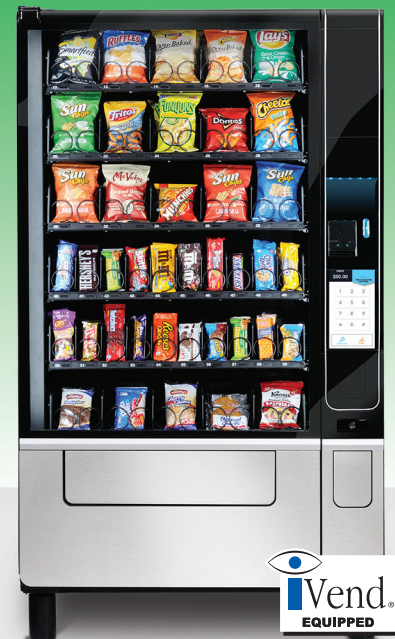
VendRevv S40 Snack Merchandiser 72" x 41"W x 35.2"D *Ship Weight 564 lbs Up to 65 Selections, 528 Item Capacity (210 Snack-Pastry/318 Candy) Card reader available.