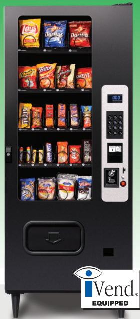
23 Select Snack Merchandiser 72" x 29.3"W x 34.75"D, *Ship Weight 431 lbs 23 selections, 384 item capacity Card reader available.