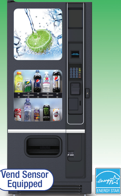
VendRevv BC10 Bottle & Can Vendor 72" x 31.75"W x 36.125"D *Ship Weight 671 lbs, 10 selections Capacity: 500-12oz cans / 240-20 oz bottles or combination of cans and bottles Standard vend sizes in ounces: 12, 16.9, 20 & 24 Optional kit needed for 250ml Energy Drink cans.