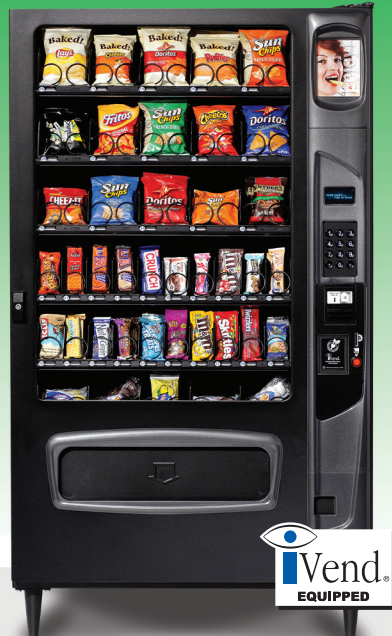
40 Select Black Diamond Snack Merchandiser 72" x 41.1"W x 34.75"D *Ship Weight 516 lbs 40 selections, 630 item capacity Card reader available.