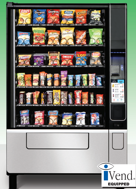
VendRevv S52 Snack Merchandiser 72" x 46"W x 35.2"D *Ship Weight 626 lbs Up to 71 Selections, 633 Item Capacity (6 Flex Steel Trays) (252 Snack-Pastry/381 Candy) Up to 83 Items, 773 ItemCapacity (7 Flex Steel Trays) (296 Snack-Pastry/477 Candy) Card reader available.