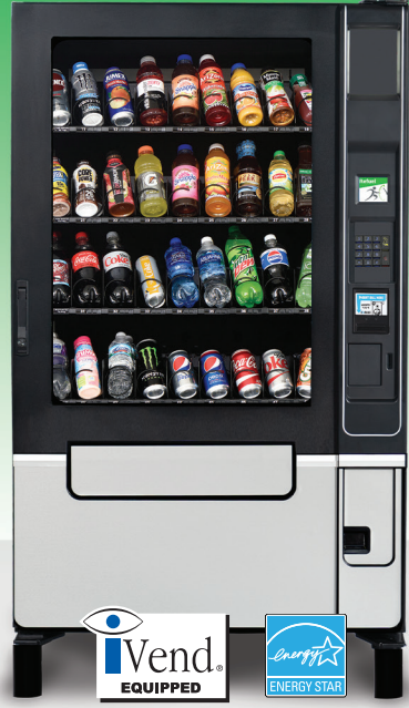
VendRevv 36 Select Elevator Chill Center Glass Front Can and Bottle Beverages 72" x 41.2"W x 38"D, *Ship Weight 831 lbs 36 Selections Capacity: 216 Beverages Card reader available