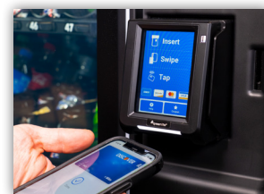
Credit/Debit & mobile reader options.